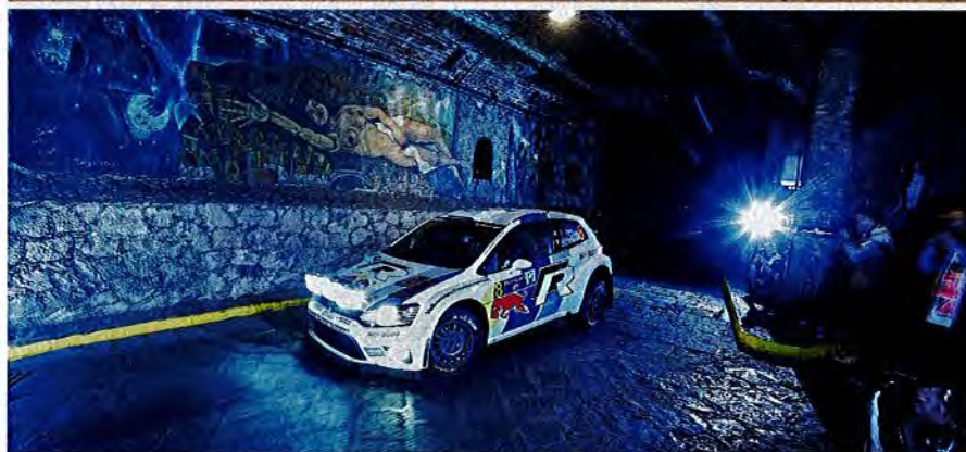
Die Stadtprüfung von Guanajuato führt durch einen graffitiverzierten Tunnel